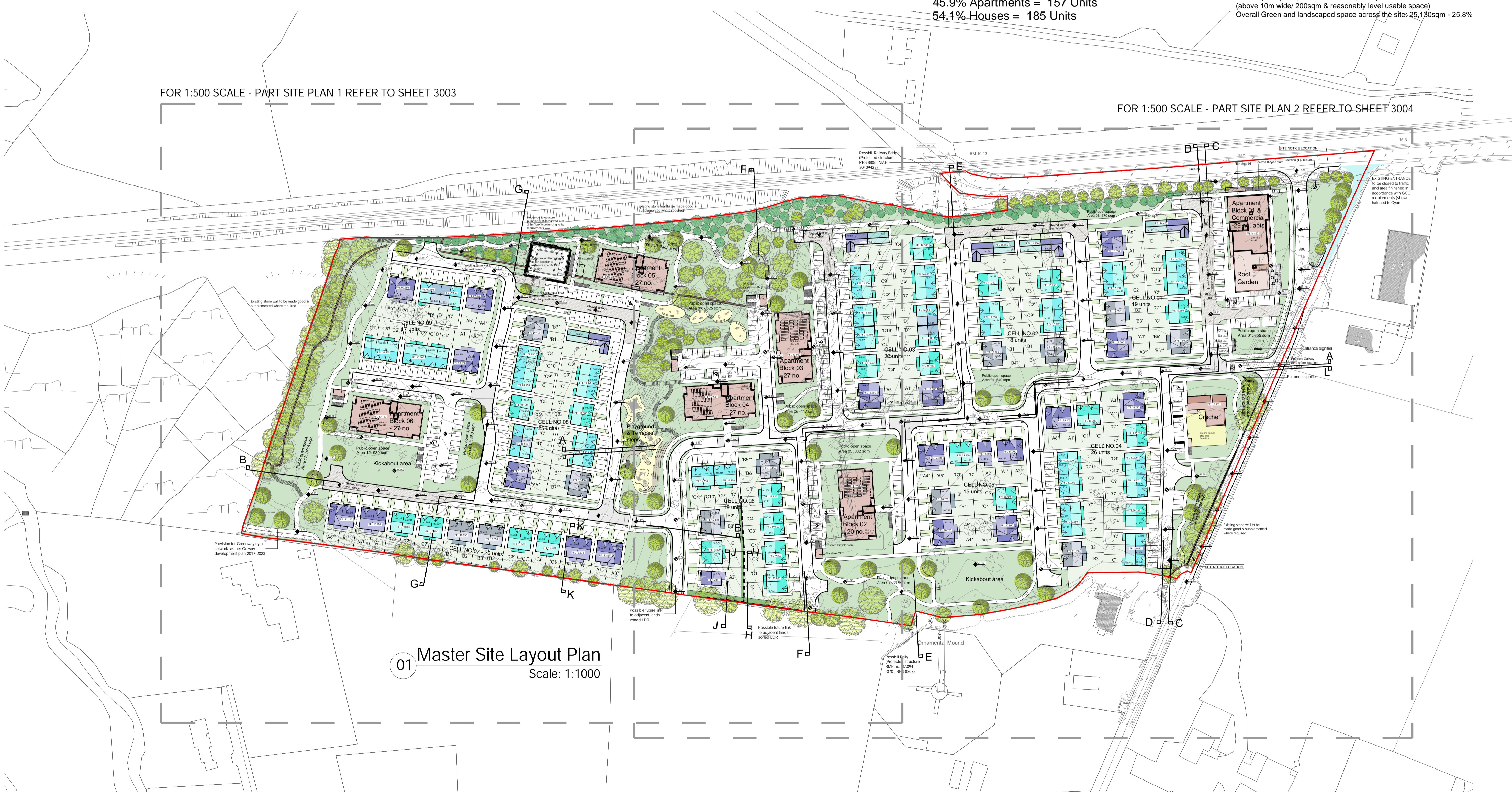
01 Master Site Layout Plan Scale: 1:1000

FOR 1:500 SCALE - PART SITE PLAN 2 REFER TO SHEET 3004